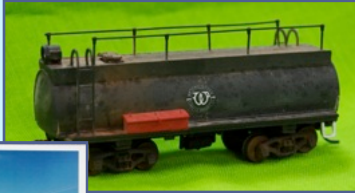
First Place Model (Tank Car): Jim Ruisinger