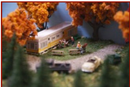
Detail on one of Craig's module used in his clinic.

• Next month's contest is Heavy Industrial Buildings/Complexes including mini dioramas 12x24 inches.