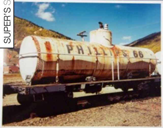
First Place Photograph (Tank Car): Tie