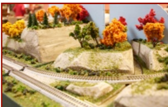
The two display modules Craig used in his clinic.

Please contact Craig if you are interested.