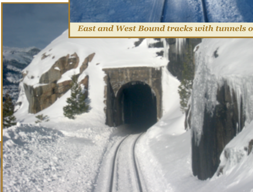
Just one of the very snow filled tunnels on Donner Pass.