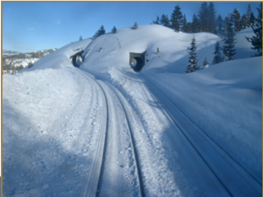
East and West Bound tracks with tunnels on Donner Pass.