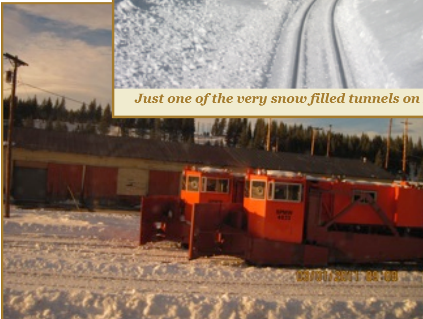
Jordon Spreaders at Truckee ready for another round of snow fighting. There were two sets of spreaders with two spreaders, one on each end with 4 locos and a caboose in the middle.