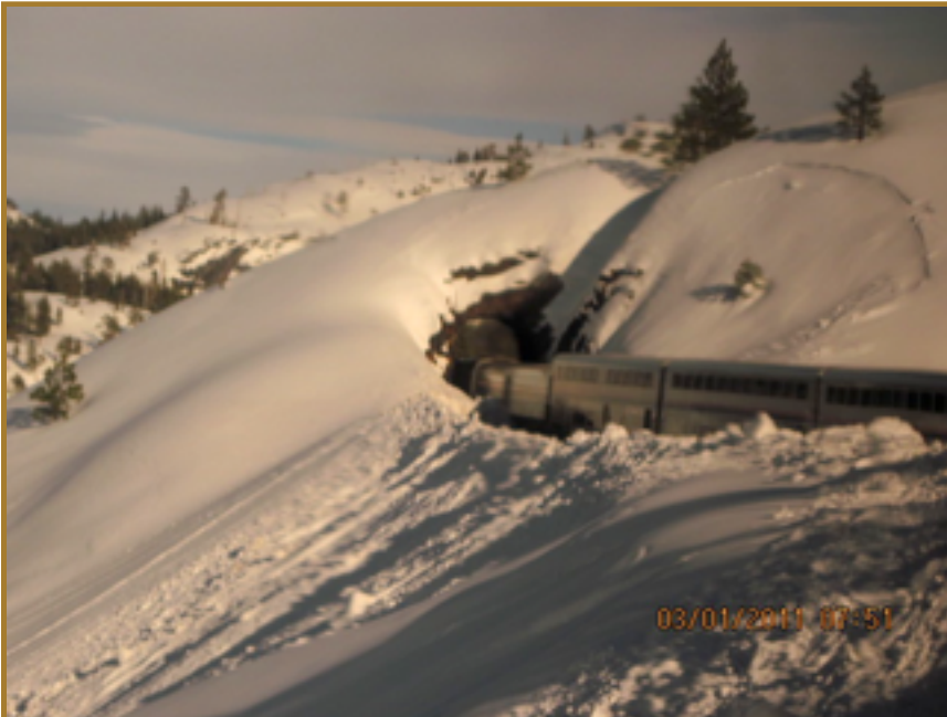
California Zephyr on Donner Pass heading into yet another tunnel.