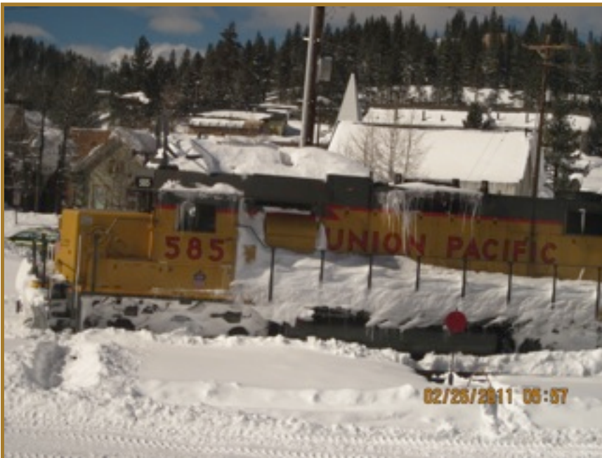
UP Snowplow Loco at Truckee - There were 4 of them with 1 caboose stuck in the middle.

I always wanted to take a train through snow. Maybe I shouldn't wish it again. We've taken numerous trips on the California Zephyr from Chicago to Sacramento, California, and never really experienced snow. We may have thought we experienced snow; but, now I know we had not.