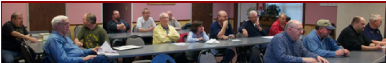
Division 6 members at St. John's Lutheran Church, 27 February.