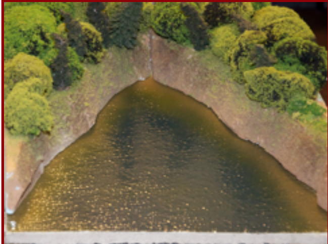
Result of modeling water.