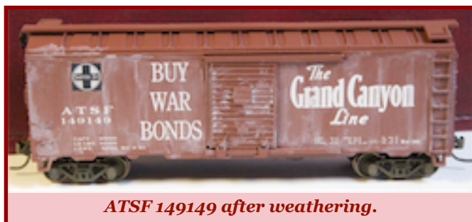
ATSF 149149 after weathering.

MCR Convention: The 2012 Pittsburgh Regional Convention, HIGH-LINE to Pittsburgh , details are in the Winter Issue of the Kingpin .