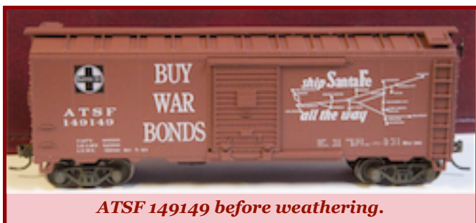
ATSF 149149 before weathering.