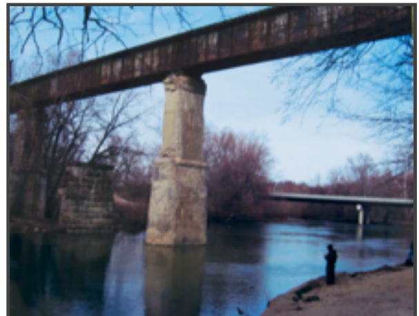
First Place Photograph