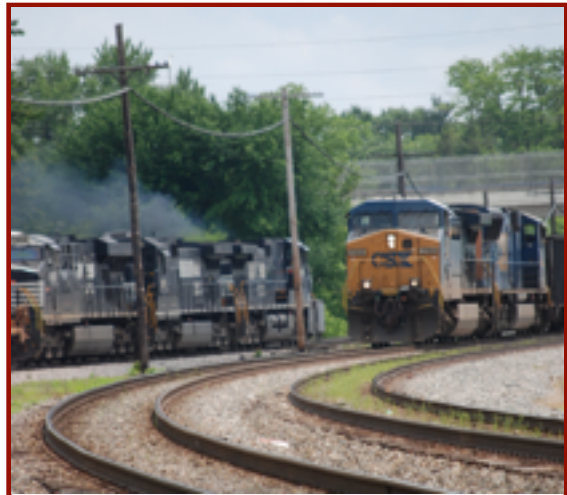
The "Other" Marion Meeting

National Convention, Grand Rapids, MI is available online: www.gr2012.org