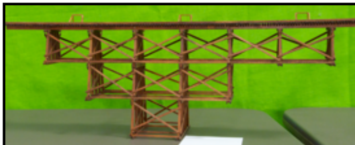
First Place Model