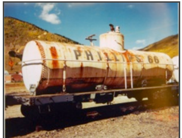
First Place Photograph