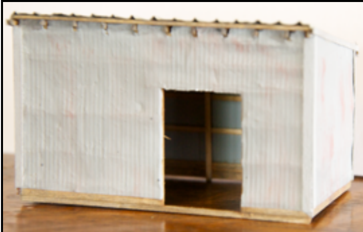
AP Merit Award