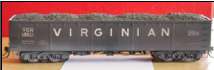
First Place Model

Certificates were handed out at the meeting.