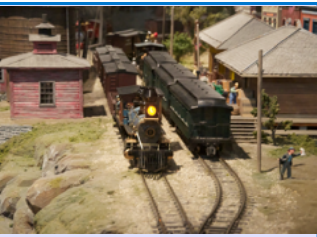
Early Period – Automatic train meet.