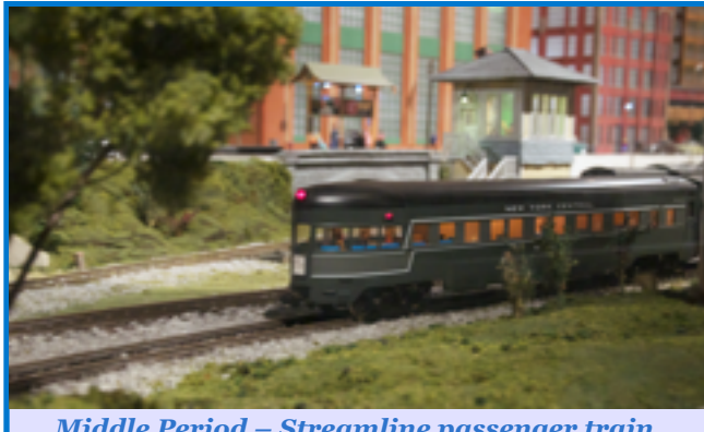
Middle Period – Streamline passenger train.