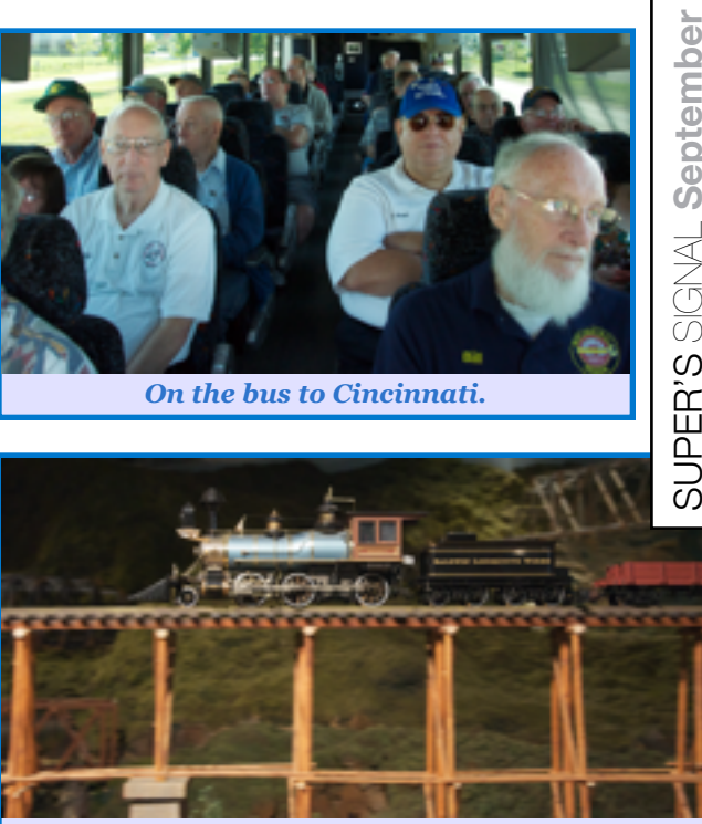
Early Period - Mogul on trestle above eye level.