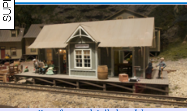
One of many detailed models.