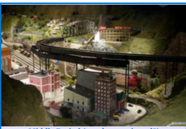
Middle Period (see the man in red?)