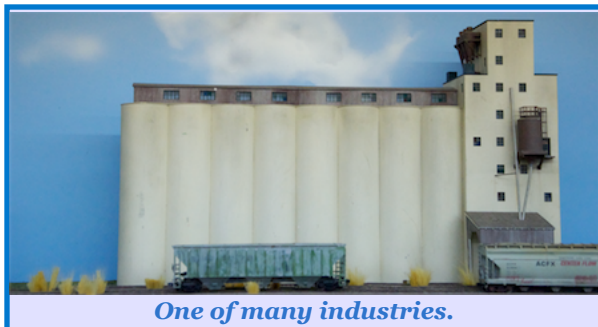
One of many industries.