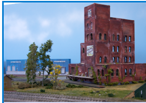
One of many industries.