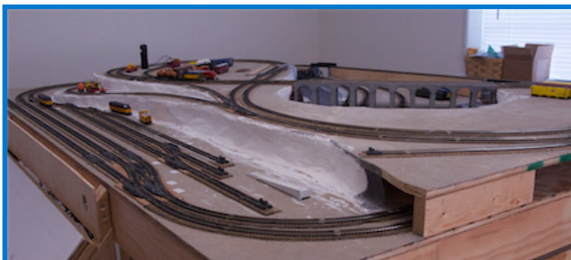
N-scale, under construction.