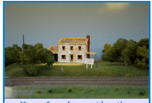
House for sale, great location.