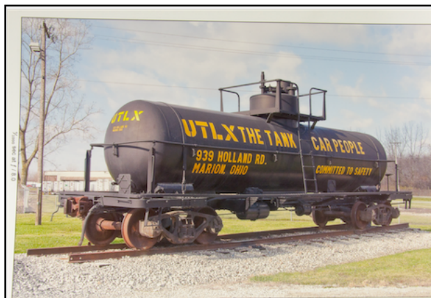
First Place Photo Oil Tank Car by Ray Thibaut