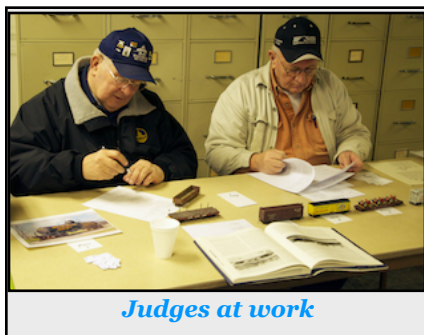
Judges at work

The next meeting will be 7 April at the St. John's Lutheran Church in Grove City. The Model Contest will be Steam Locomotive and the Photo Contest will be Steam Locomotives also. It's time to be making a decision on what models your going to take to the MCR Convention , 15-18 May 2013.