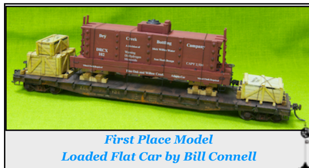
First Place Model Loaded Flat Car by Bill Connell