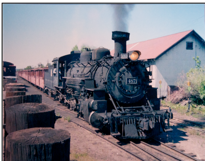
First Place Photo Cumbres & Toltec #487 by Don Wilke