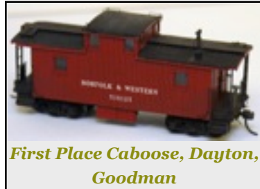
First Place Caboose, Dayton, Goodman