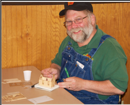
Built A Model by Dick Briggs, MMR