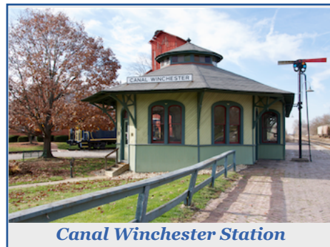
Canal Winchester Station

Next Division 6 Steering Committee Meeting 23 October 7:00 PM at Dave Matheny's