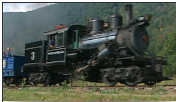
The Durbin Rocket, a Climax geared logging locomotive

All along the way we passed through intermittent brilliant sunshine and sudden pouring rain! We road in the first car behind the engine; this is an open car. I love riding that close to the engine; I can feel its power and pull. Also I get its soot and spray!! A look at a picture of me shows me soaking wet; but, smiling at the ride! A link on Division 6 WEB Site may show a brief video taken as the Durbin Rocket pulls in for our ride. This one, also,