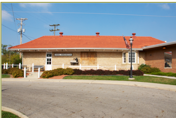
The Other Depot: The Scioto Valley Traction Company Depot built on the north side of the Ohio and Erie Canal. It is located at its original position, about half a mile south of the Hocking Valley Depot.