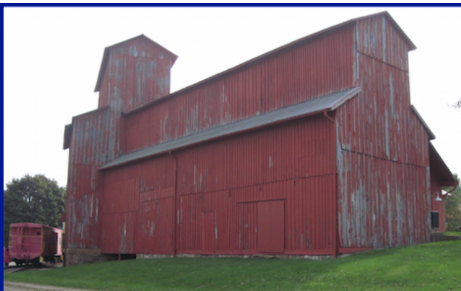
O.P. Chanery Grain Elevator