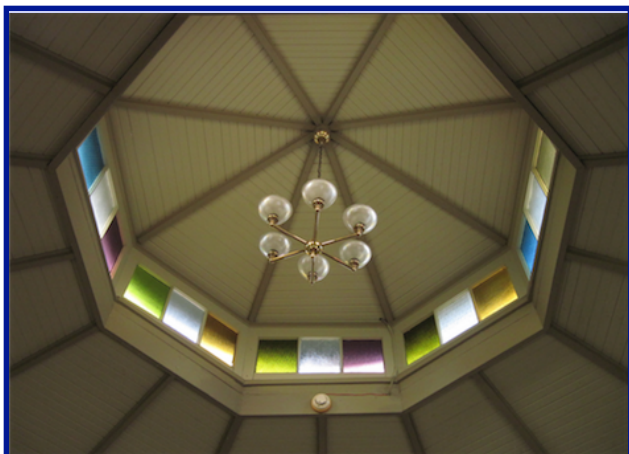
Interior ceiling of the Waiting Room Canal Winchester Depot

Grain was unloaded from farm wagons at the grain dump on the south side of the building. Buckets on a canvas belt raised the grain to the storage units on the second and third floors. When the grain was ready to be shipped, it was lowered in the same manner to the waiting railroad cars.