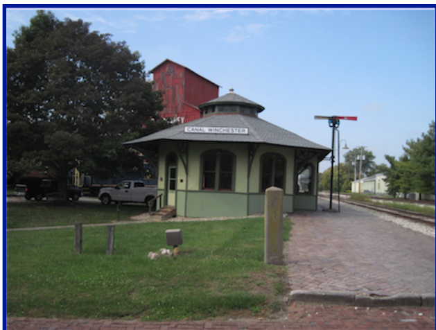
Canal Winchester Depot "Queen of the Line"