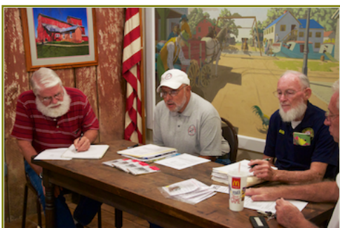
Division 6 Officers.