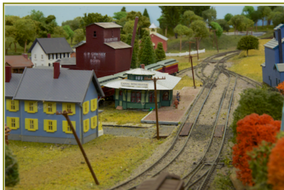
Canal Winchester on the Canal Winchester N-Scale Club.