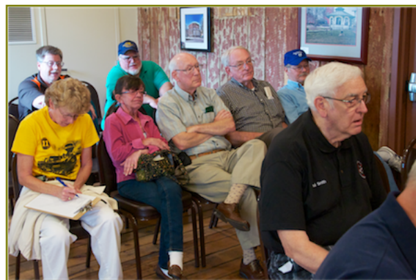
Some of the Division 6 members.