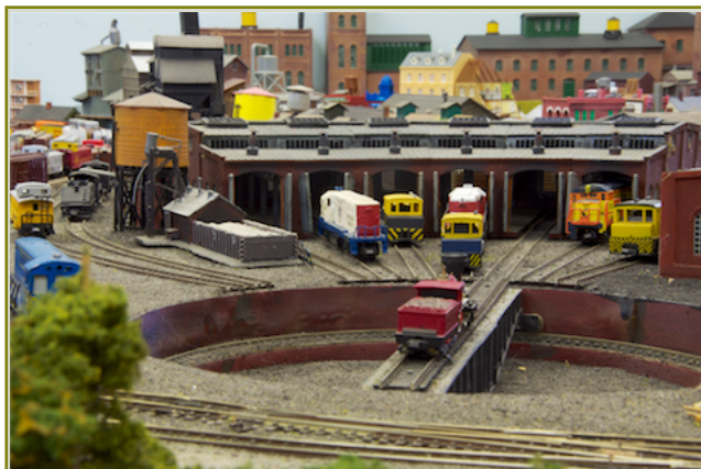
Roundhouse at the Canal Winchester N-Scale Club.