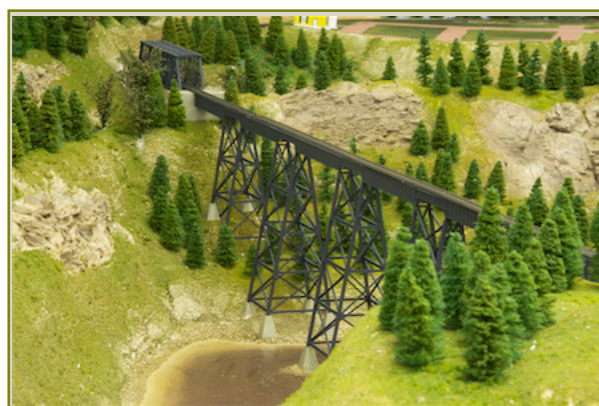
High Bridge on the Canal Winchester N-Scale Club.