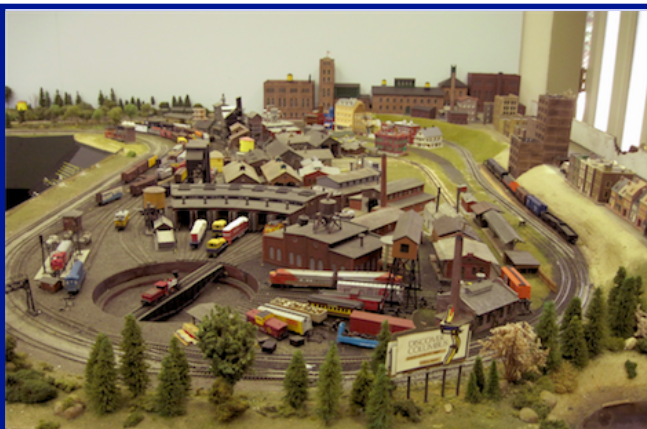
Canal Winchester N-Scale Club