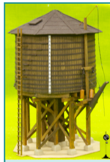
1st Place Model, Dick Briggs.