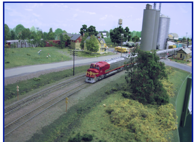
Santa Fe through Quincy controlled by the interlocking machine.

GTW continued operations on the northern and central portions of the former DTI for many years. Through other purchases, Genesee & Wyo-