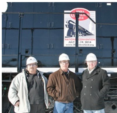
Conventional officials pose with No. 3215 in Altoona.

Cleveland 2014 WEB Site: www.2014cleveland.org