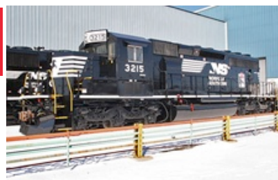
No. 3215 at Altoona on Jan. 30.

Cleveland 2014 WEB Site: www.2014cleveland.org