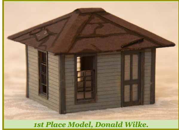
1st Place Model, Donald Wilke.

The contest results for Ned Harlow's are as follows: