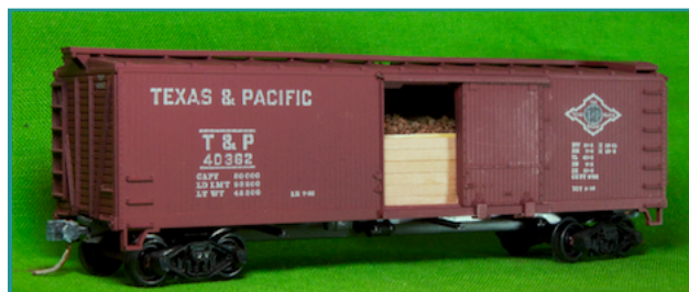
2nd Place Model, Don Wilke.