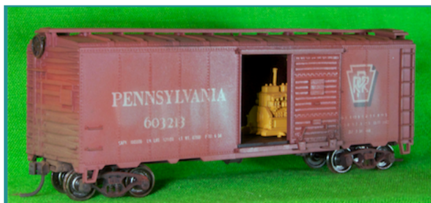
1st Place Model, Dick Briggs.