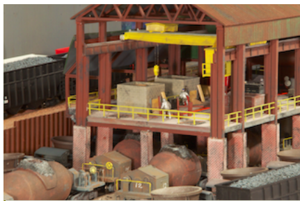
Rolling Mill on Paul LaPoint's Layout.