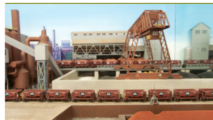
Ore unloading on Paul LaPoint's Layout.