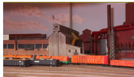
Davis Steel cars waiting to be loaded on Dave Stout's Layout.