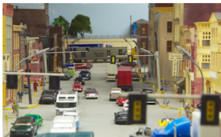
Detailed Street scene on Dave Stout's Layout.