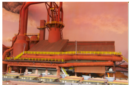
Open hearth furnace on Dave Stout's Layout.