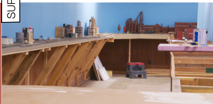
North Bay of the Zanesville Club.

As seen from the front of the layout, three 'bays' are seen, as shown below, and a staging yard is hidden behind a wall of the south bay. A working yard will be seen to the back of the staging yard after the wall ends. Some track is down, but there is some discussion about the best sub roadbed to lay the rest of the track on. The Zanesville Club's layout should provide long runs and keep many members busy running trains. This will be interesting to watch as the layout comes together.