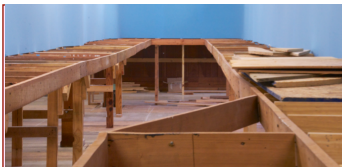
Middle Bay of the Zanesville Club.