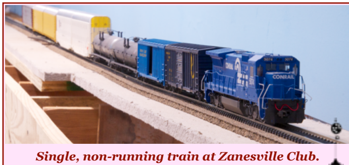
Single, non-running train at Zanesville Club.