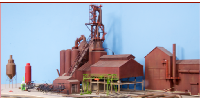
Steel Mill is coming soon at the Zanesville Club.