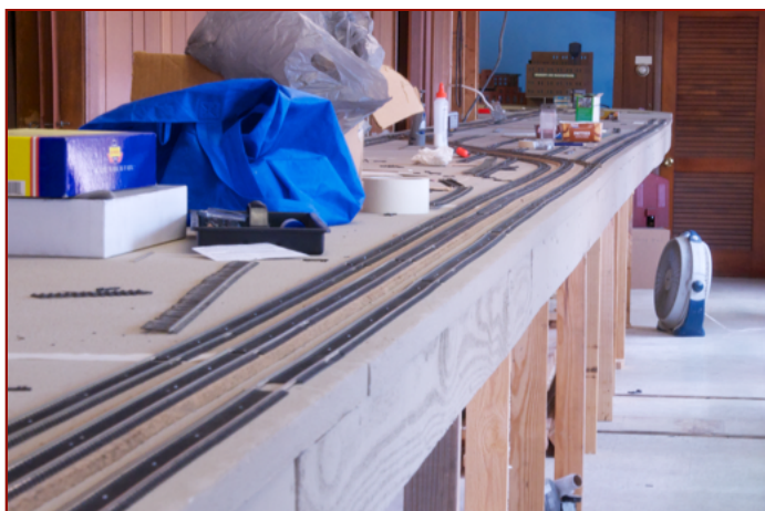
Staging Yard to the right and working yard in back.