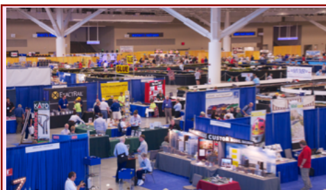
The National Train Show.