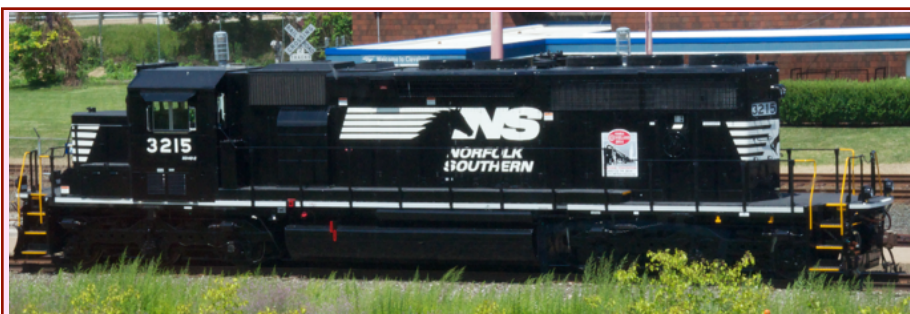
NS #3215 with the NMRA Convention Logo parked outside the Convention Center.

There were a number of Division 6 members at the convention, either full time or just for a day or two. Some came for the day and some stayed in one of the two convent hotels. The Marriott Hotel was across the street from the Convention Center entrance, but still a block long walk before coming to the main convention rooms. The Renaissance Hotel was adjacent to The Terminal Tower, about three block further southwest of the Convention Center.