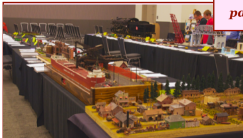
The contest room.