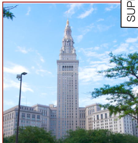
Cleveland's Terminal Tower and Renaissance Hotel.