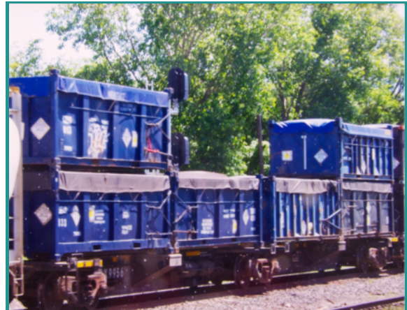
1st Place Photo, Don Wilke.