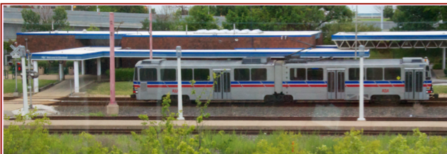
The "Rapid Transit" passing Amtrak's Station.