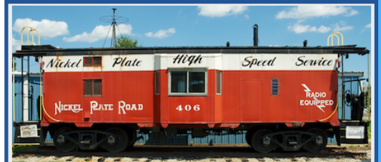
Nickel Plate Caboose #406 outside the Coshocton Club

Parking is across the road from the club.