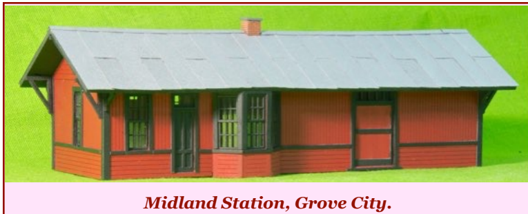
Midland Station, Grove City.

In 1891 the Midland Route added daily passenger service between the then village of Grove City and Union Station in downtown Columbus. The passenger service provided commuter service to the factory workers in the area surrounding the Union Station. Passenger service was discontinued in the 1950's. In 1891 the Baltimore and Ohio RR assumed operation of the Midland Route.