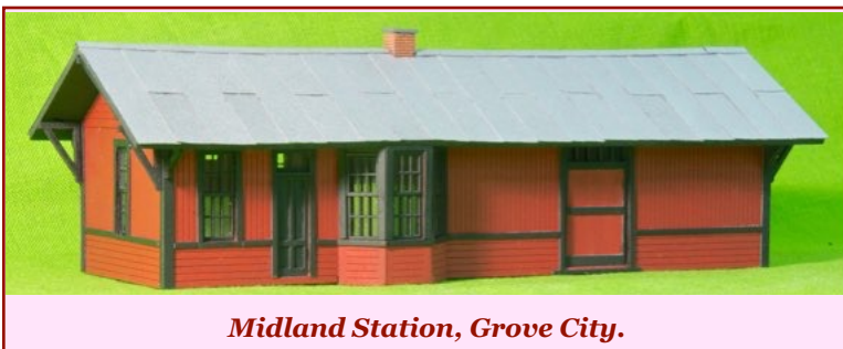
Midland Station, Grove City.

In 1891 the Midland Route added daily passenger service between the then village of Grove City and Union Station in downtown Columbus. The passenger service provided commuter service to the factory workers in the area surrounding the Union Station. Passenger service was discontinued in the 1950's. In 1891 the Baltimore and Ohio RR assumed operation of the Midland Route.