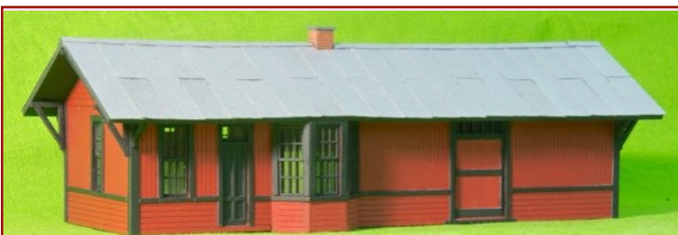
Midland Station, Grove City.

In 1891 the Midland Route added daily passenger service between the then village of Grove City and Union Station in downtown Columbus. The passenger service provided commuter service to the factory workers in the area surrounding the Union Station. Passenger service was discontinued in the 1950's. In 1891 the Baltimore and Ohio RR assumed operation of the Midland Route.