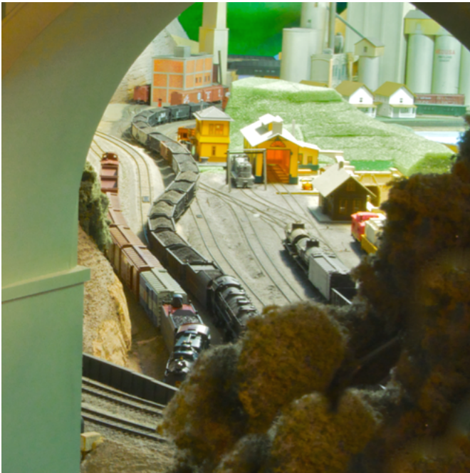
Guy Tham's Layout 2008