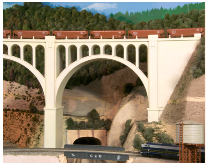
Guy Tham's Layout 2008