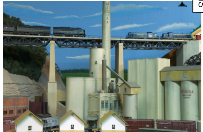
Guy Tham's Layout 2008