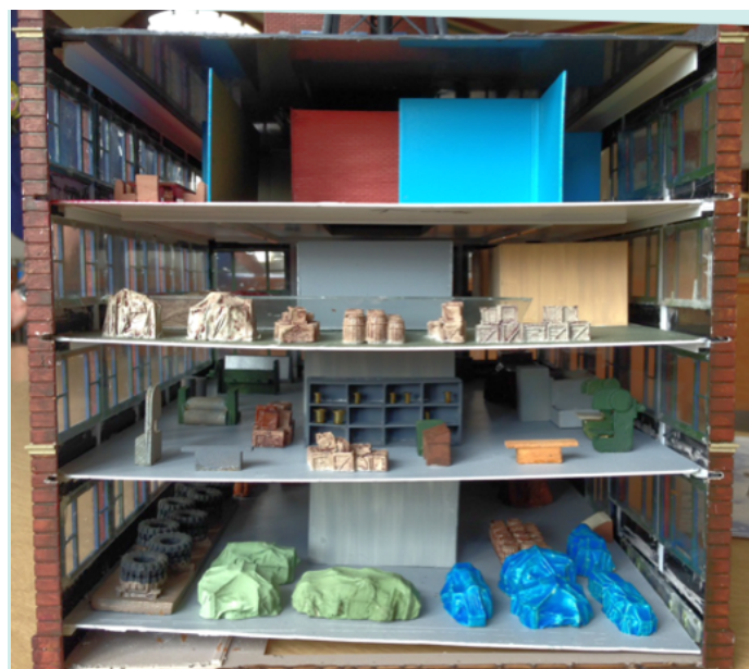
1st Place Model, Pat Hreachmack. Interior