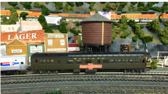
Lost Santa Fe Observation on Ken Hyel's Layout.