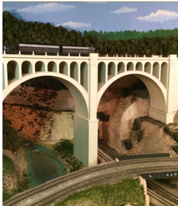
High Bridge on Guy Thrums' Layout.