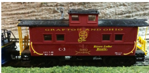
Grafton & Ohio Caboose on Guy Thrums' Layout.