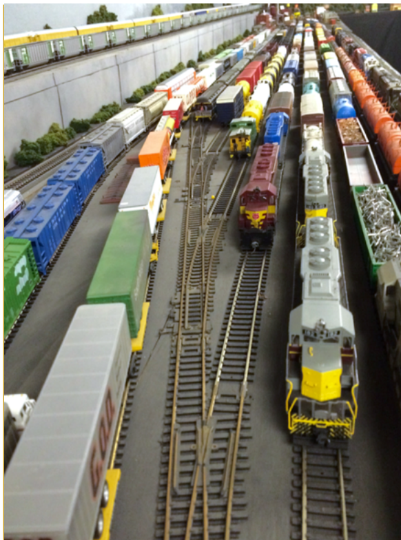
One Working Yard on Ken Hyel's Layout.