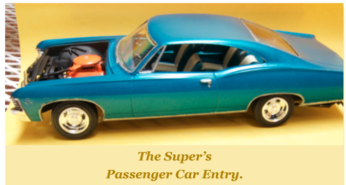
The Super's Passenger Car Entry.