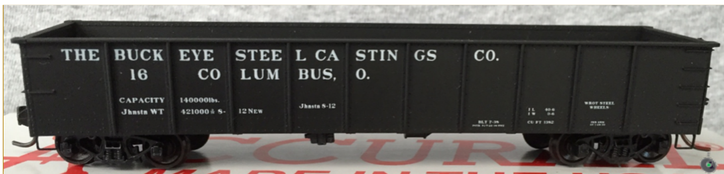
Buckeye Steel Castings Gondola

The Gons will NOT be sold before the convention!!! The Gons will be $20 each, 3 for $55, if ordered WITH THE CONVENTION REGISTRATION and should be picked up at the Convention Company Store. Cost will be $23 each if purchased at the Company Store during the convention.