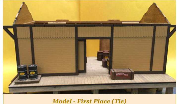
Model - First Place (Tie) Freight Station – Al Doddroe.

Remember, Show up and Put up, models and pictures that is.