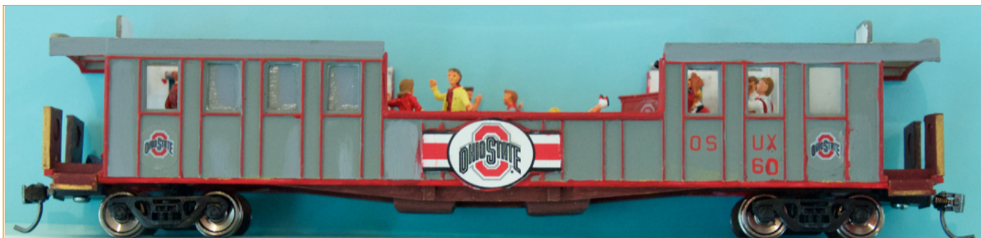
Model - First Place OSU Rockin & Rollin Lounge Car Pat Hreachmack.

Remember, Show up and Put up, models and pictures that is.