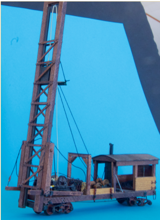
Model - First Place Pile Driver Darrell Logan.