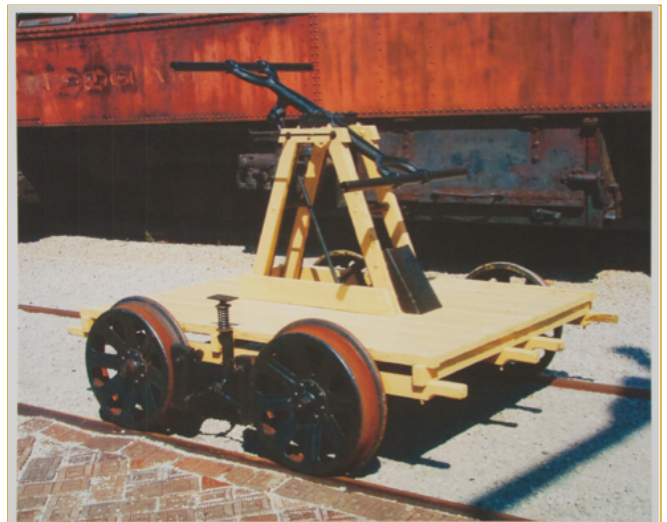
Photograph - First Place Hand Car Peggy Doerflein.