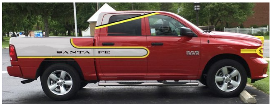
Dick's New Truck.