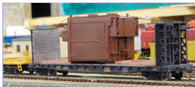
Jet Transshipment, Inkjet that is.