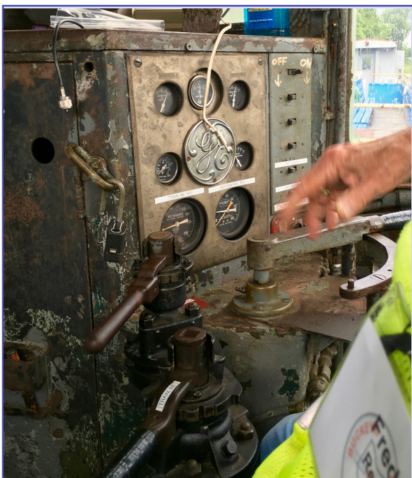
GE Control Stand