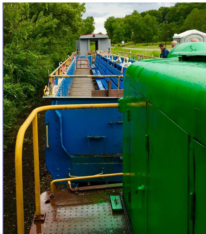
Zanesville & Western Scenic Railroad