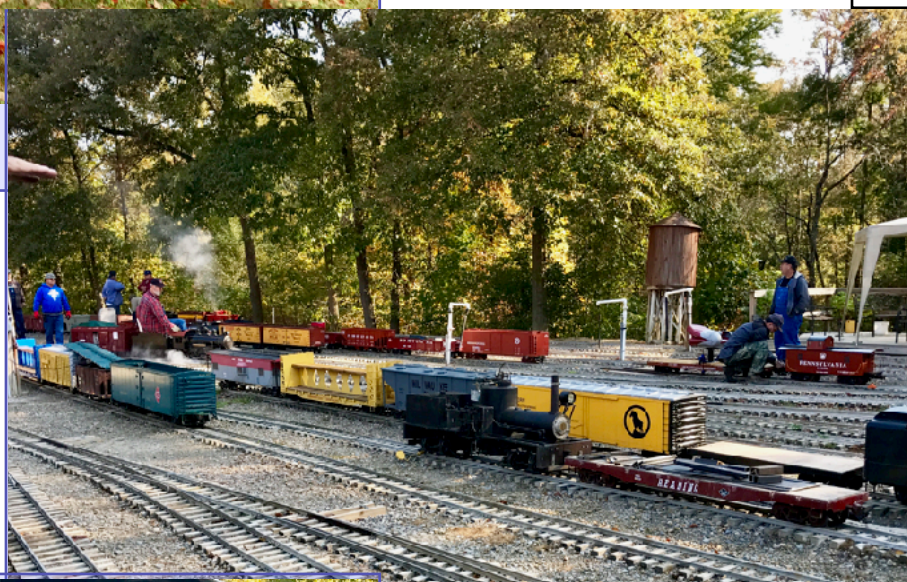
Mill Creek Central Railroad Main Yard.