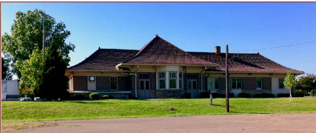
Cleveland, Akron & Columbus Railroad Depot.

The Cleveland, Akron & Columbus (CA&C) Railroad Depot was originally built for the CA&C Railroad in 1907. The Depot now serves as not only the Welcome Center for Ariel-Foundation Park, but also an information hub and a stop on the Ohio to Erie Bike Trail. Inside there are updated modern conveniences, a spacious main hall, and offices for the Knox County and Mount Vernon Parks departments. The location is part of the Ohio Erie Trail system running from Cleveland to Cincinnati on the old rail bed that once carried the Pennsylvania Railroad.