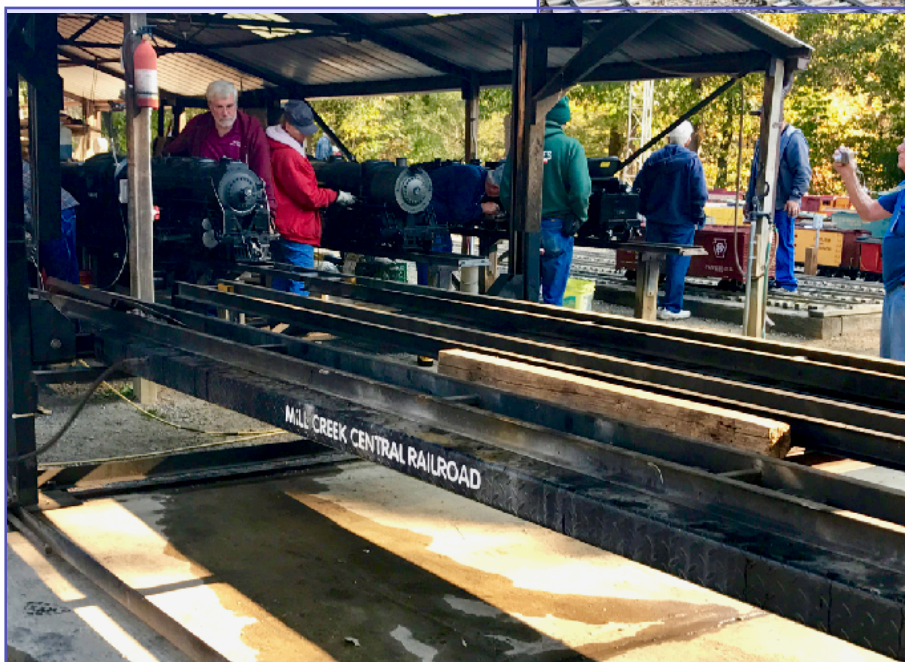
Mill Creek Central Railroad 3-D Transfer Table.

Mill Creek Central & A.M.R.E.C. Continued on page 8.