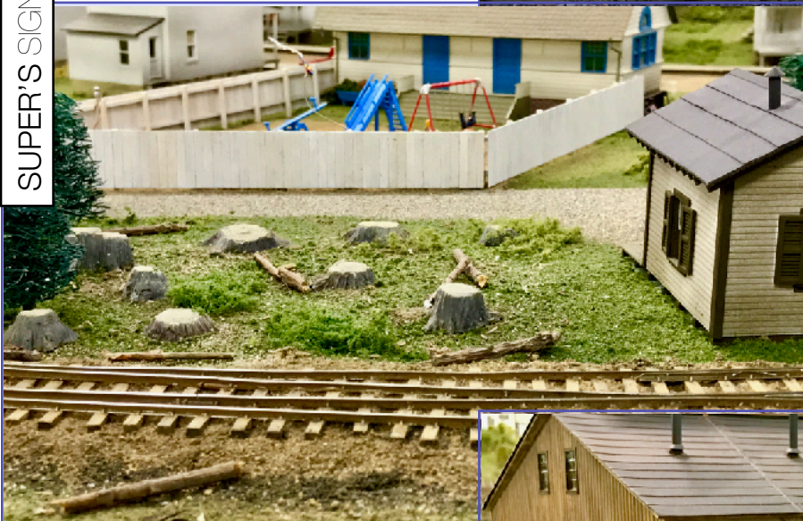
A.M.R.E.C. New School.