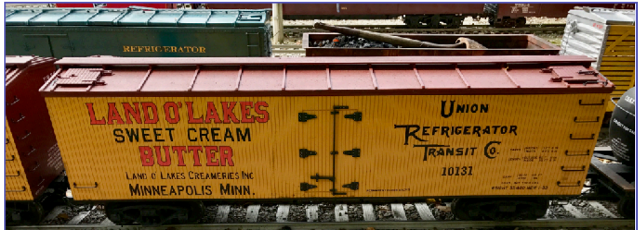
Mill Creek Central Railroad When is the Next Refer Contest? Note the Coal & Shovel in Hopper.

Continued: Mill Creek Central & A.M.R.E.C.