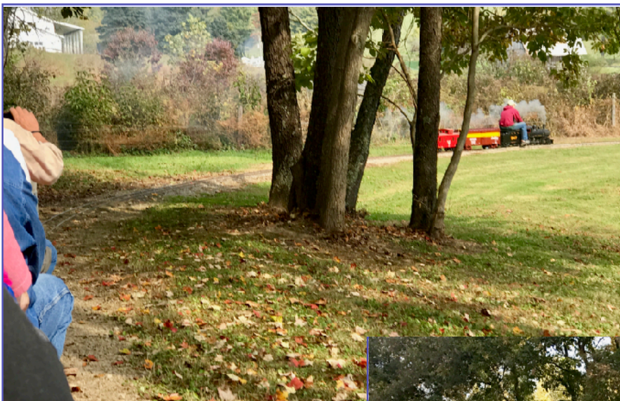
Mill Creek Central Railroad Riding the Second Section.