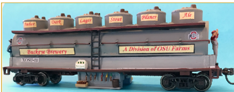
Model - First Place Buckeye Brewery #XOSU-11 Pat Hreachmark.