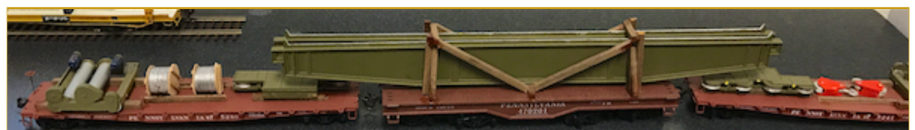
1st Place Model Fred Rea