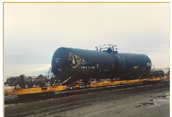
1st Place Photo Lon Wilson

This can include: Fire train cars, track maintenance cars, Speeders, Self propelled wrecking cranes, Camp Cars, Flangers, Snow plows, Dormitory Cars, etc. IT DOES NOT INCLUDE CABOOSES. We have a separate contest for those later this year. If you have any questions, please feel free to contact me.