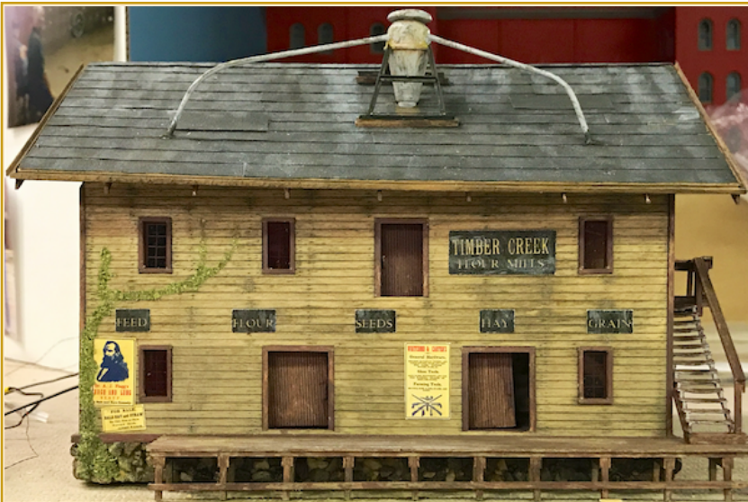
1st Place Model Flour Mill Jerry Severson

Special Note: Please relay our desire that photos be on good quality photo paper stock and not just any old paper. Photo paper can be glossy or matte finish.