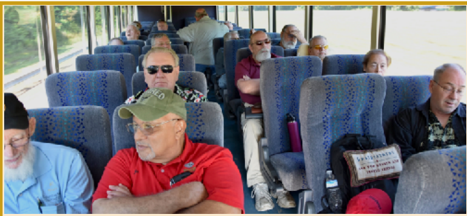
On the Bus to Scenic Express.