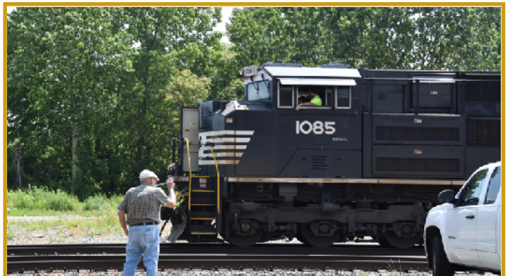
Is the door open for air conditioning?