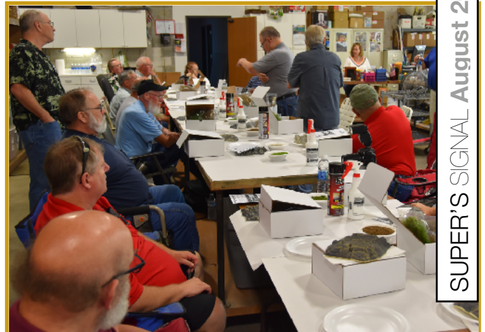
Receiving instructions on making a scene.