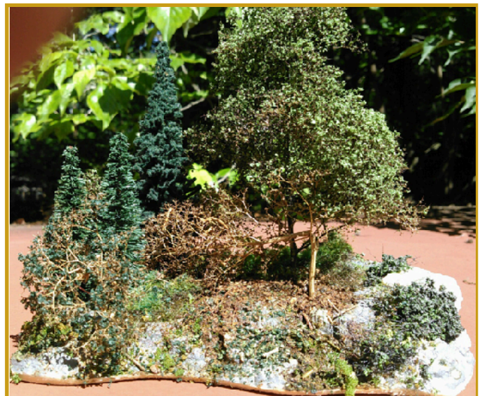
Finished scene with trees.