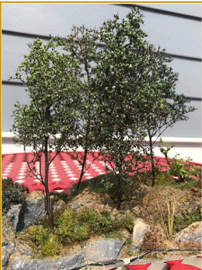
Finished scene with trees.