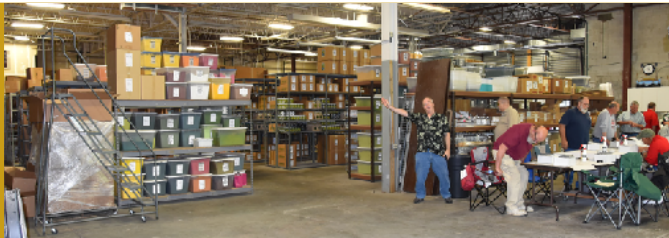
Part of the Scenic Express Warehouse.