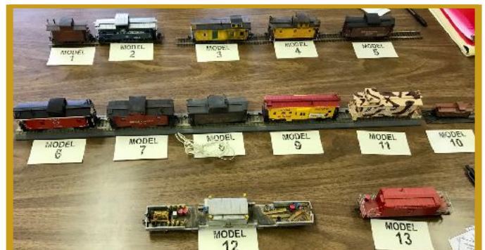
A lot of great models for the contest.