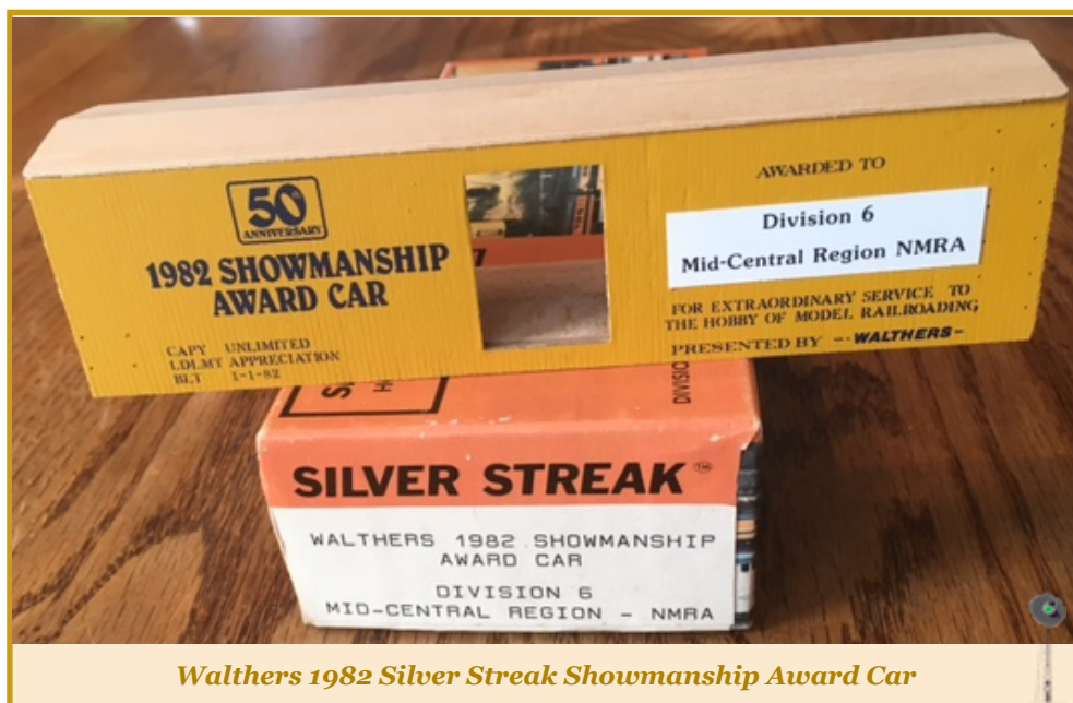
Walther's 1982 Silver Streak Showmanship Award Car

Is anyone aware of where, when or why it was produced and or awarded? Is it a one-time car awarded to the division? Did the NMRA provide a car to each region or division? The Division 6 sign is an add on sticker which leads one to consider it may be a one of a kind. I have no idea where or when I acquired it. Anyone who can shed light on this car, please let me know.