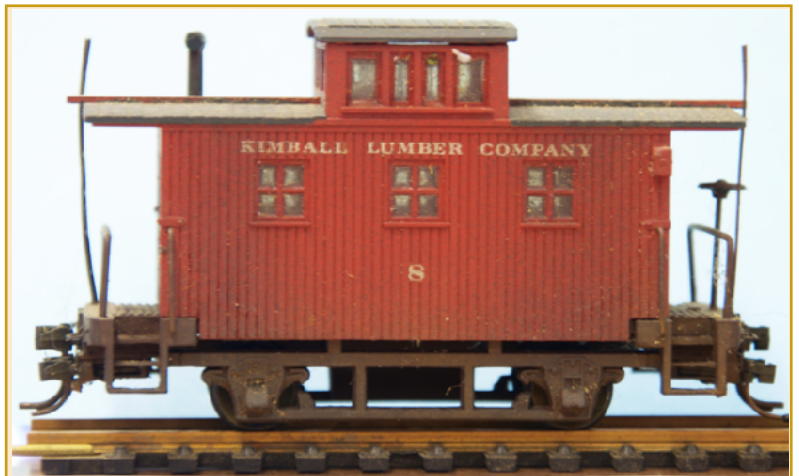
Kimball Lumber Co. Bobber Butch Sage