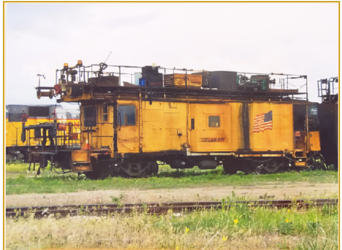
Loram Fire Fighting Caboose # 391380 Lon Wilson

As 2017 winds down, I'm working on the schedule for next year... It will closely follow this year's contests but with a few wrinkles. As soon as the division meeting schedule is set, I'll have a schedule for contests plugged in and ready to go, so stay tuned. See everyone on November 19th at COMRC.