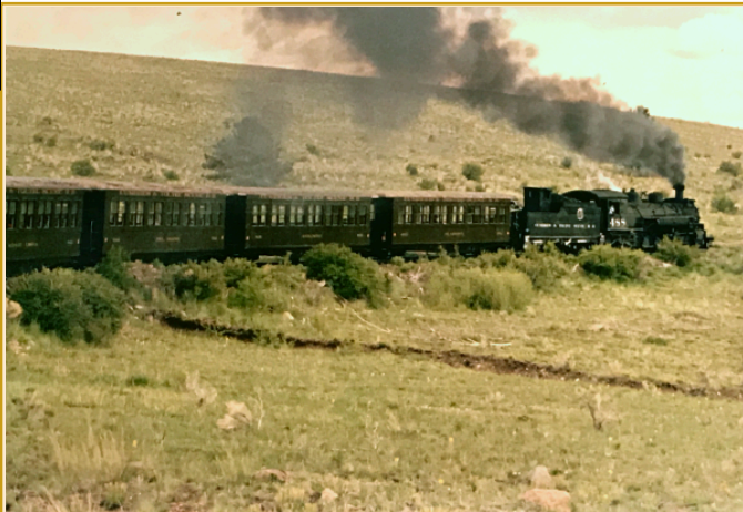
Cumbres & Toltec Scenic Railroad Passenger Train.