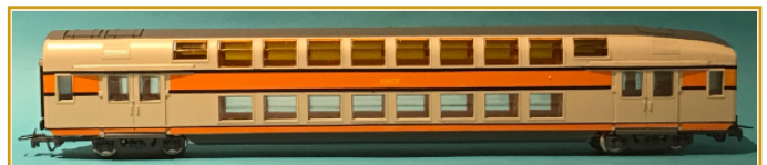
SNCF Passenger Car Lon Wilson

Model and Photo subjects will be... Open Freight Car WITH Load.