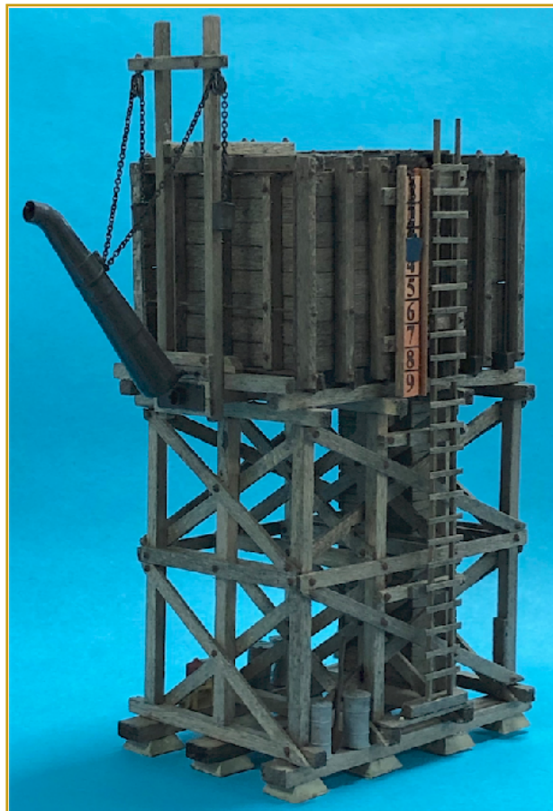
Ice Fork Creek Wooden Water Tank Howdy Lamprecht

From the Contest Department: Lancaster Meeting Contest Recap