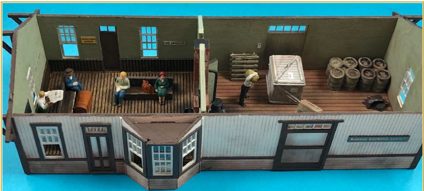
Midland Station at Grove City Howdy Lamprecht