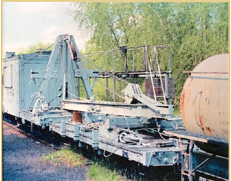
D&RGW Work Car in the weeds at Chama NM Don Wilke

Remember, your photo may be of either the prototype or a model.