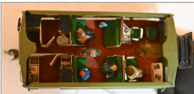
“Miss Bev’s Car” (an old Walther’s Piker kit) Howdy Lamprecht

Our contest subjects for 2019 will closely mirror what we did in 2018. Remember, photos can be of the prototype or a model and should be on good quality photo paper, preferably mounted.