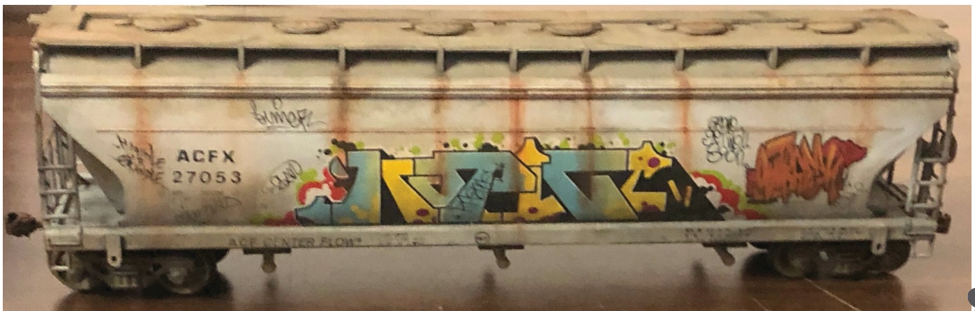
1st Place Model – Mike Wolf Graffiti'ed up ACF Covered Hopper