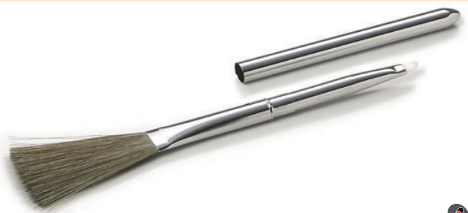
The Tamiya Model Cleaning Brush.