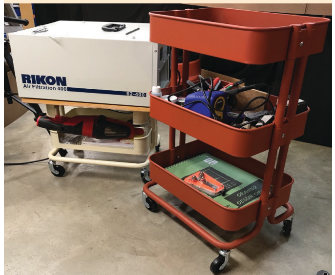
A three level cart called RASKOG as a rolling stand for my Rikon circulating/filtration fan.