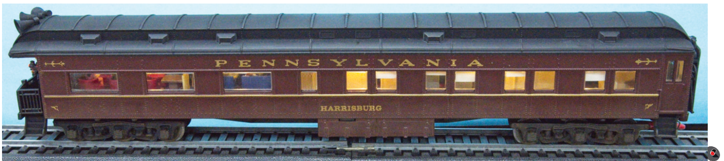
1st Place Model – Mike Wolf PRR 60' Heavy Weight "Whistle Stop Campaign" Observation Car