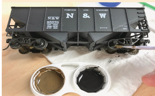
Lens case capacity is perfect for small batches of custom color or washes. Caps allow for short-medium term storage