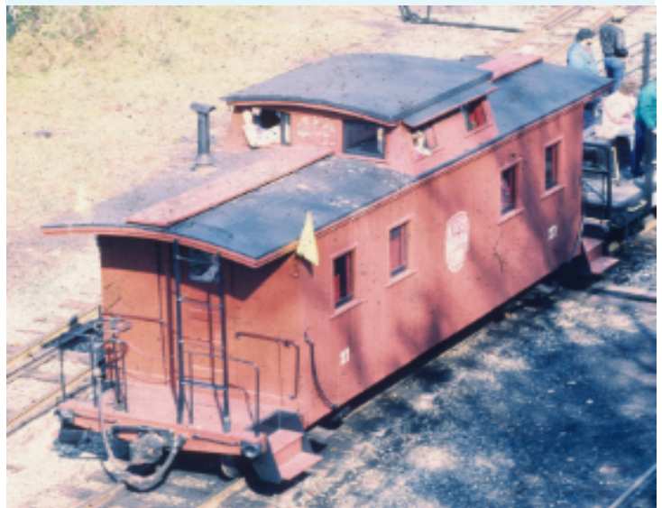
1st Place Photo

3rd Place (Tie): Jim Borcz, C&O Caboose # 90740 (model)