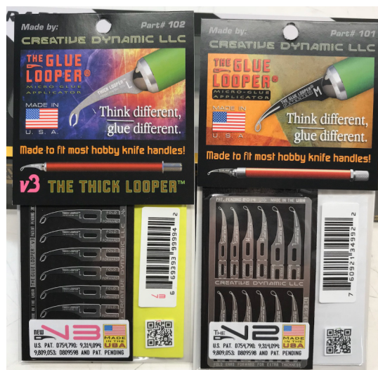
Glue Looper V3 and V2 for thick and thin glues, respectively