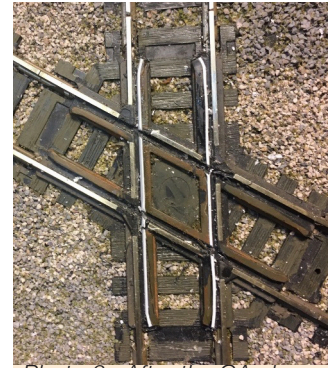
Photo 6. After the CA glue has cured a little paint and weathering and you'll never know the styrene was added. The crossing route is a dummy track so I didn't bother repairing to those guardrails.