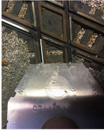
Photo 5. A quick check using the Standards Gauge shows a 0.02" wide strip of styrene will bring the gap to within tolerances.