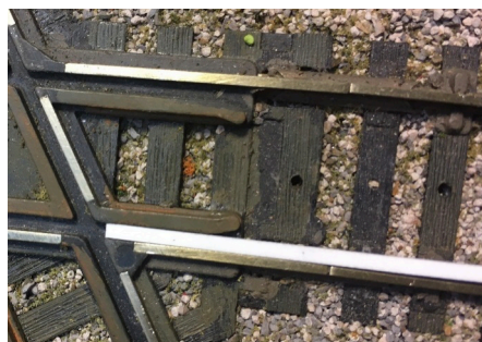
Photo 3. The flangeway is approximately 0.06" (the width of the styrene strip used to bring the guardrail distance within specs).

NMRA Standards in Trackwork Continued on page 9 .