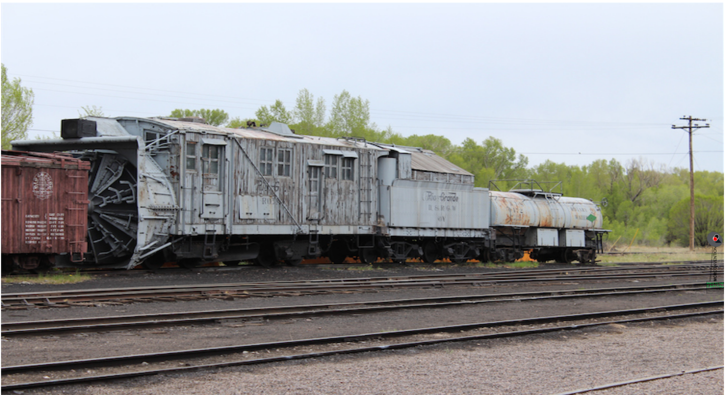
1st Place