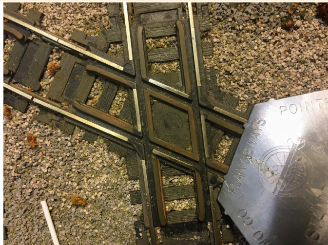
Photo 1. This Atlas code 100 crossing has excessively wide flangeways that can (and have) led to derailments when the wheels drift and “catch” the diamond. The FLANGEWAYS side of the NMRA Standards Gauge clearly shows the flangeways are too wide.

If you are having derailment problems around a turnout or crossing, grab your trusty NMRA Standards Gauge and check the various clearances (points, flangeways and track gauge). If the guardrails are out of spec, this technique could help reduce derailments and increase your enjoyment running the railroad. Better yet, take the time to check your trackwork BEFORE you install it (if you are building new). It is a lot easier to correct on the workbench than it is on the back corner of the layout!