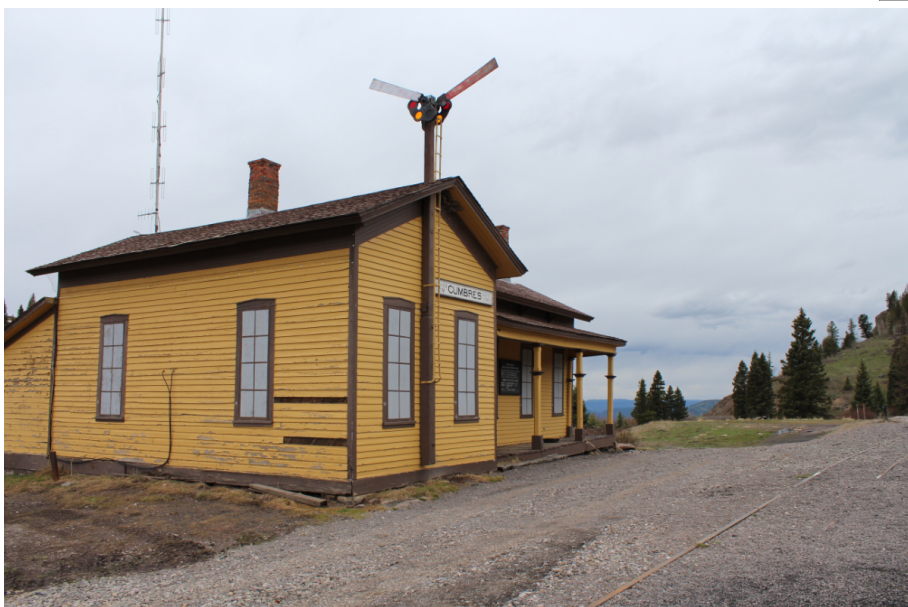
1st Place