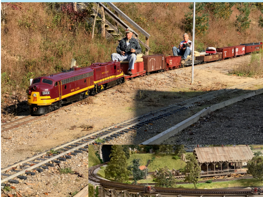
1st Place Photo for June