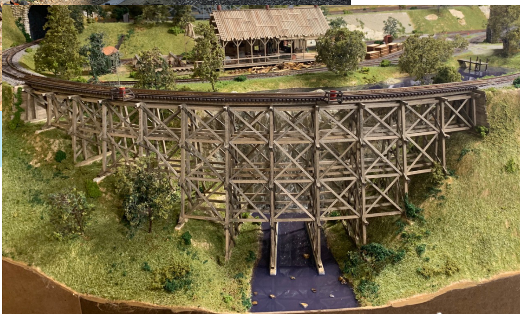
1st Place Photo for July