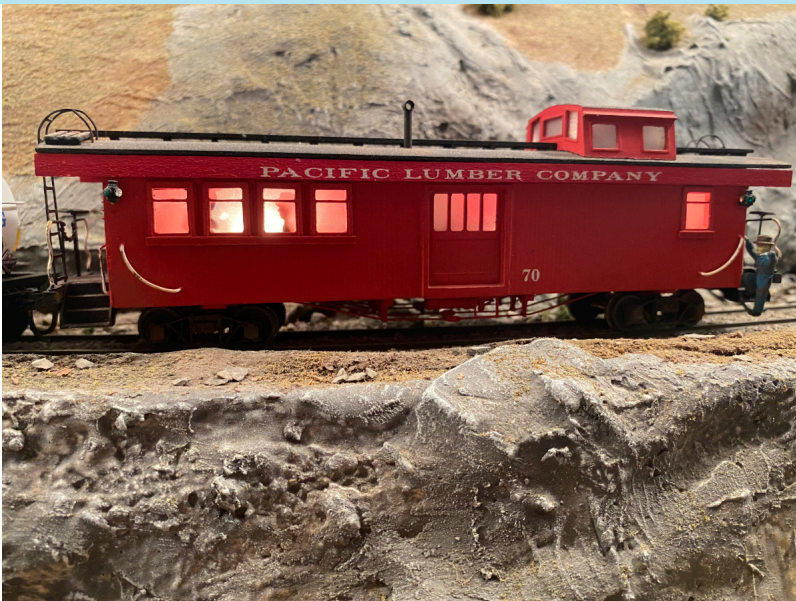
1st Place Photo, Howdy Lamprecht, MMR®