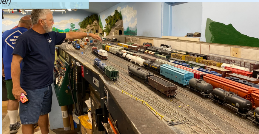
Mark's Cridderville Yard