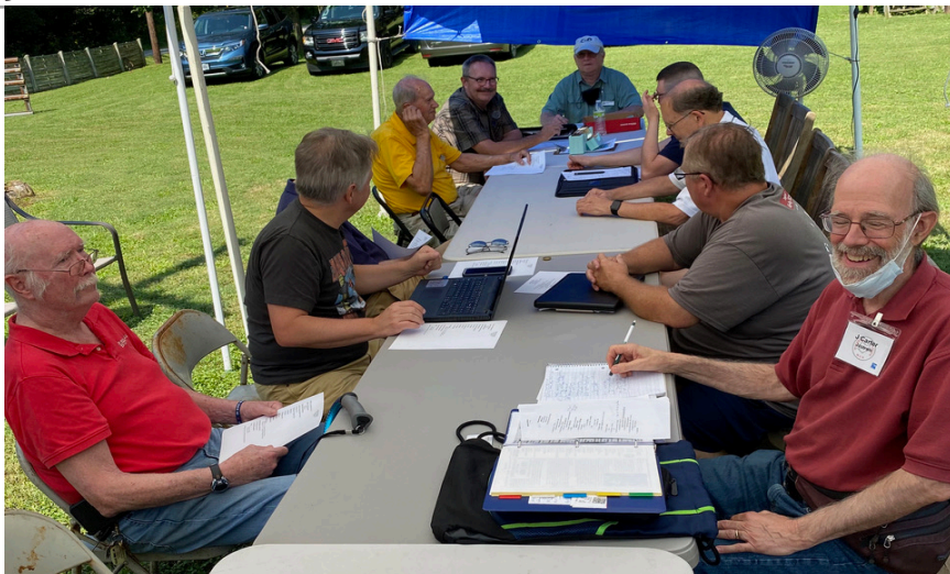
Division 6/9 Meeting