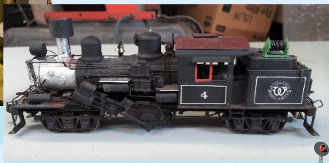
1st Place Model, Jim Ruisinger