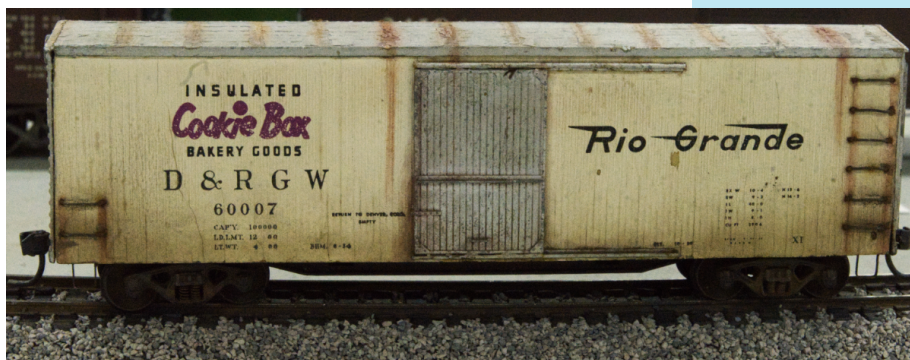
1st Place Model by Howdy Lamprecht