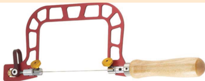
Knew Concepts Jewelers Saw

The confusing thing about dental tools is their naming conventions. This product manual helps de-mystify some of the naming.