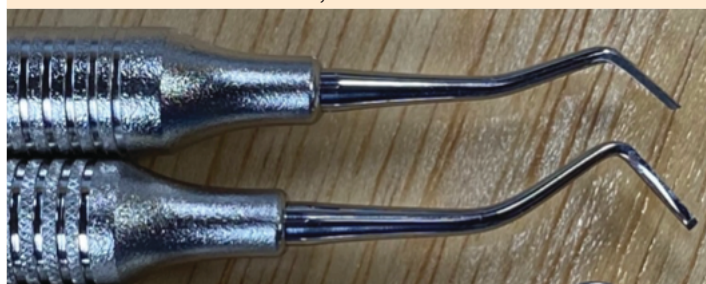
Dental Tool: 12 – 6 – 12 on top, 10 – 7 – 14 bottom

https://www.premierdentalco.com/wp-content/uploads/2019/09/Instrument-Catalog.pdf