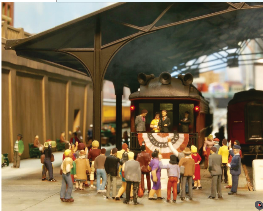
1st Place Virtual Photo by Mike Wolf

2nd Place: Howdy Lamprecht, B&O Streamline Vista Dome Car