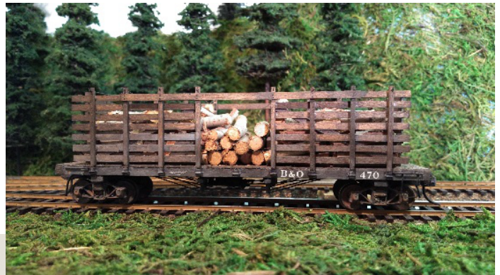
1st Place Virtual Photo by Jim Ruisinger

3rd Place: Howdy Lamprecht, Olive Grove Lumber Bulkhead Flat Car with Wrapped Lumber Loads